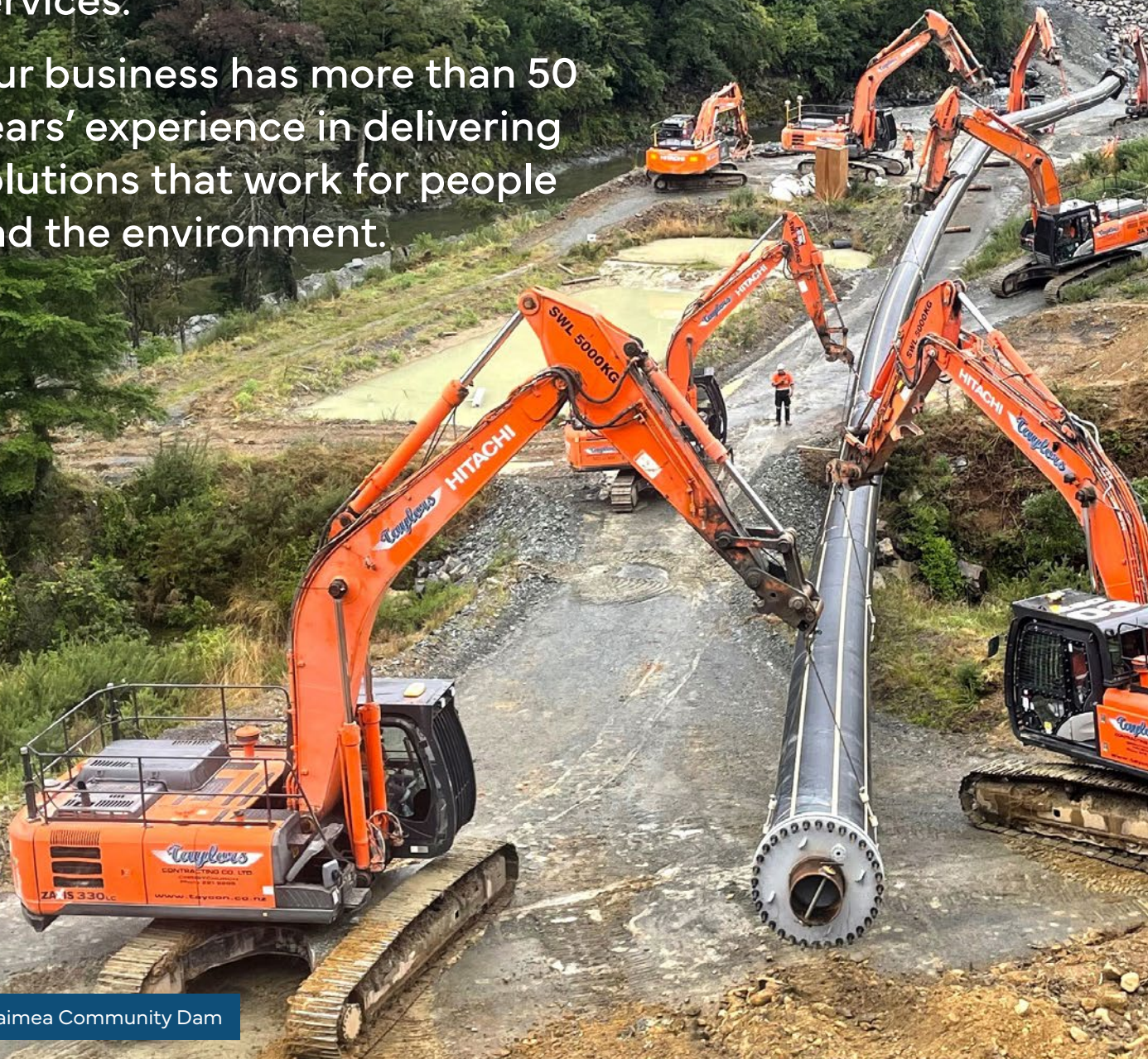
Waimea Community Dam

Our business has more than 50 years' experience in delivering solutions that work for people and the environment.